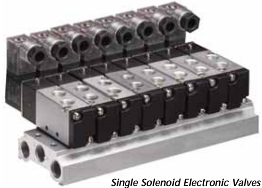
Single Solenoid Electronic Valves Mounted on 8-Station Manifold

This numbering schematic is shown for illustration purposes only. All possible configurations are not available. For standard models, see the products illustrated in this catalog.